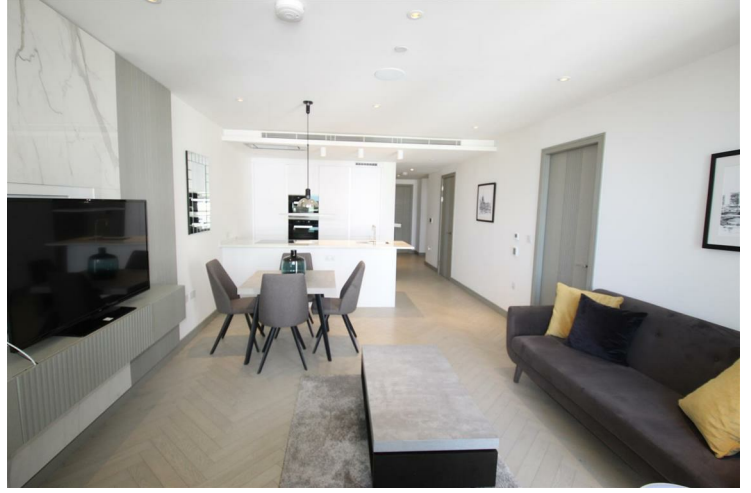
Reception room view