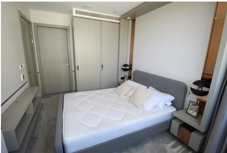
Bedroom 1 view