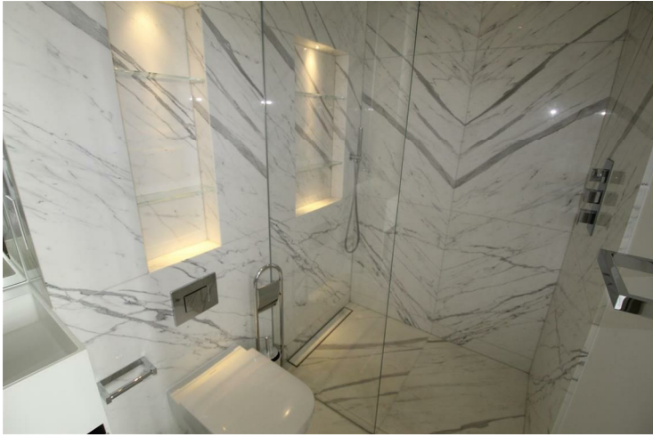
En suite shower room