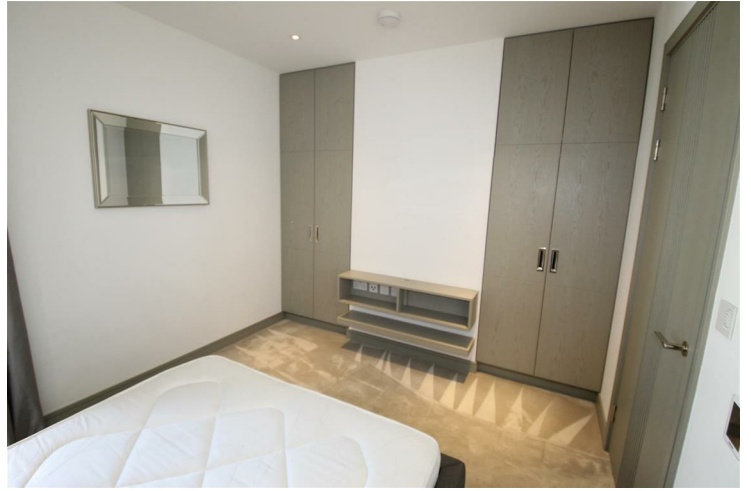
Bedroom 2 view